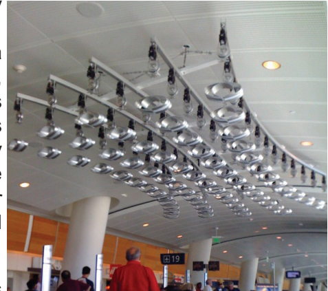
The implementation of the artwork at San José International Airport makes use of the convenient modular nature of SmartMotor™

difficult in such a high traffic area. Diagnostics are greatly simplified with the SmartMotor™