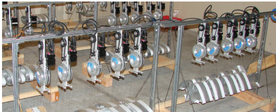
Chronos and Kairos in development.